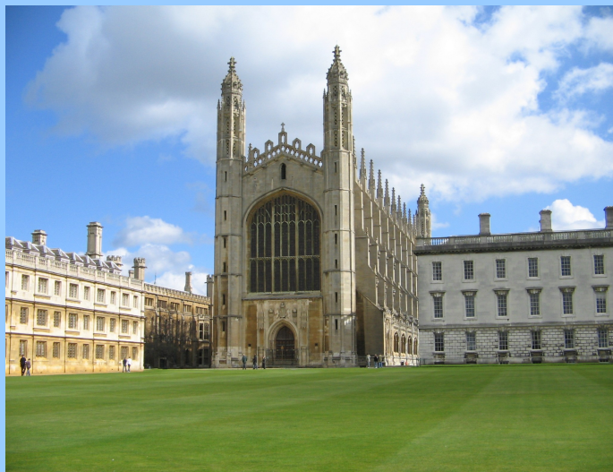
King's College Chapel